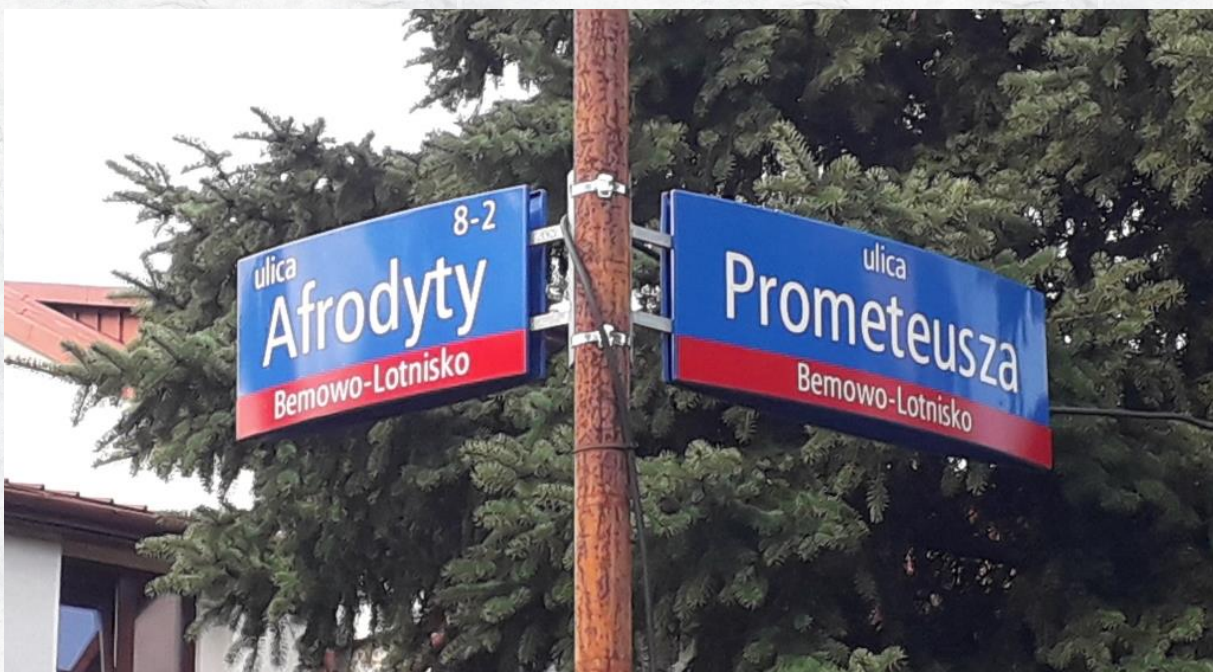
Street signs bearing the names of Aphrodite and Prometheus in the neighbourhood of the Zeus Housing Estate in Warsaw

Faculty of "Artes Liberales", University of Warsaw, June 27, 2022 , online