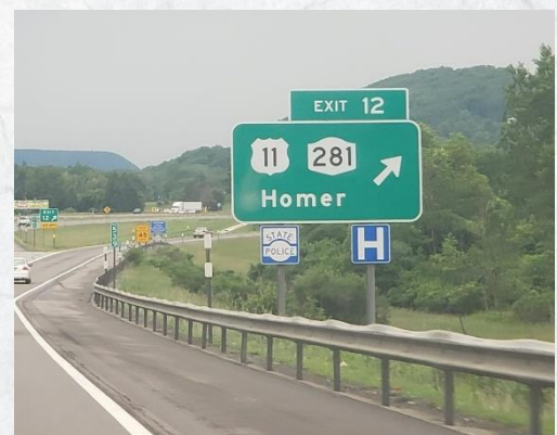
Destination Homer